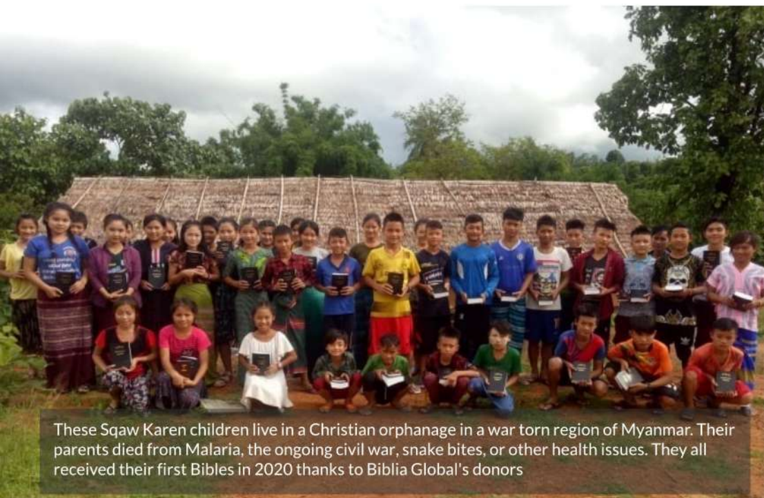
These Sqaw Karen children live in a Christian orphanage in a war torn region of Myanmar. Their parents died from Malaria, the ongoing civil war, snake bites, or other health issues. They all received their first Bibles in 2020 thanks to Biblia Global's donors

20,000 SQAW KAREN BIBLES FUNDED IN 2020, TO BE DELIVERED IN 2021 23,545 SQAW KAREN BIBLES FUNDED IN 2019, DELIVERED IN 2020