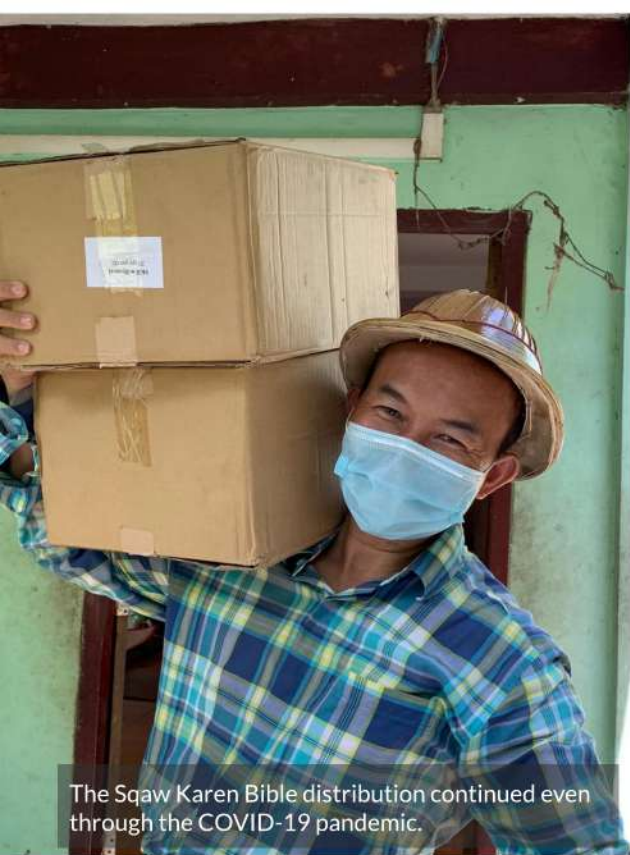
The Sqaw Karen Bible distribution continued even through the COVID-19 pandemic.