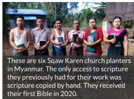
These are six Sqaw Karen church planters in Myanmar. The only access to scripture they previously had for their work was scripture copied by hand. They received their first Bible in 2020.