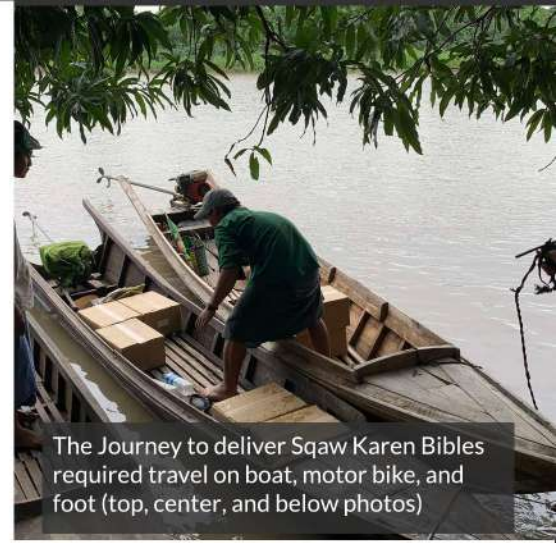
The Journey to deliver Sqaw Karen Bibles required travel on boat, motor bike, and foot (top, center, and below photos)